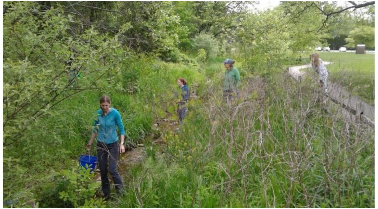
Photo from our first UU Families Adopt-a-Stream work day on May 11 at Bryan Park.